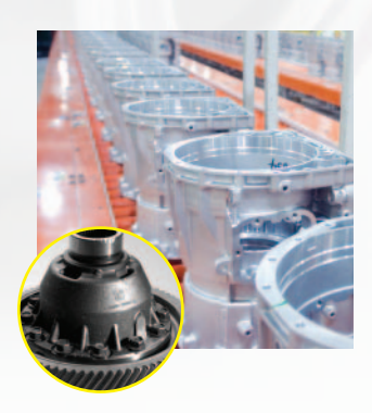
Automotive Traceability DataMan 500 is optimized for DPM code reading applications and can read both 1D and 2D codes.