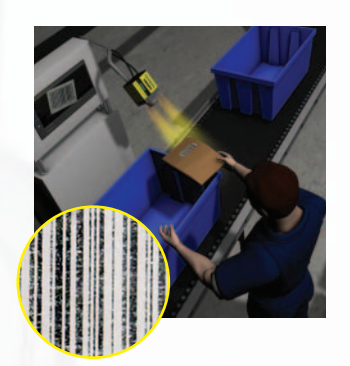
Presentation Scanning DataMan 500 can be setup for presentation scanning stations.