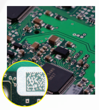
Code Reading on PCBs for Electronics DataMan 500 can read small to large 1D and 2D codes, at the same time!