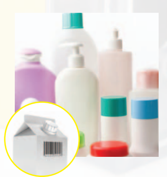
Code Reading on Packages DataMan 500 reads codes on virtually any surface—from plastic to glass to corrugated material.