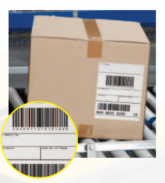
Side Scanning DataMan 500 can be set up to read codes in print and apply or other side scanning applications.