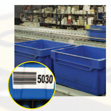
Tote ID & Sorting DataMan 500 reads barcodes on totes quickly and accurately.

DataMan 500 is used for code reading, tracking and sorting in a variety of industries and is the first image-based reader to be able to successfully accomplish logistics applications that were traditionally dominated by laser scanners. DataMan 500 is ideal for many retail and parcel distribution, postal and logistics applications, such as: