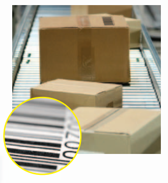
Top Side Sorting DataMan 500 reads barcodes on fast moving ship sorter applications.